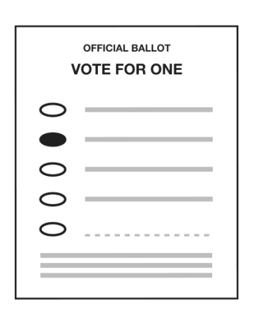
Vote for the number allowed.