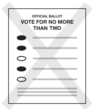
Don't vote for too many.

If you make a mistake, ask a poll worker for a new ballot or follow the instructions in your ballot packet.