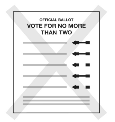
Don't vote for too many.

If you make a mistake ask a poll worker for a new ballot or follow the instructions in your ballot packet.